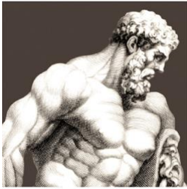
THE STARK CENTER