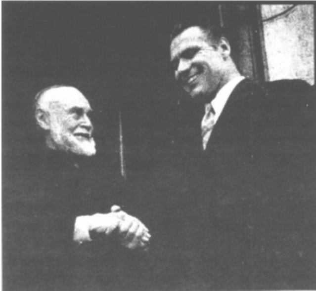
JOHN GRIMEK BLUSHES AFTER BEING KISSED GOOD-BYE BY THE LEGENDARY FRENCH PHYSICAL CULTURIST. PROFESSOR EDMOND DESBONNET IN 1949.

Many years have passed since I first heard of Professor Edmond Desbonnet, founder and publisher of La Culture Physique magazine. His untiring efforts as a writer were prolific and he wrote many books on training and lifting. His books were filled with interesting biographic sketches about famous strongmen 'round the world. His efforts pioneered and popularized physical culture in France and had a marked influence on the rest of the world.