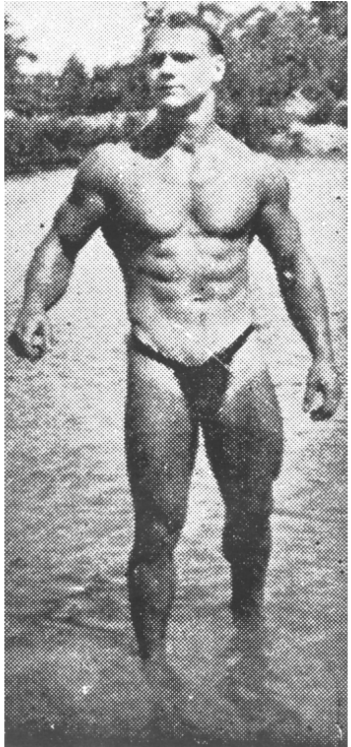
JOHN GRIMEK FROM A MILO BARBELL ADVERTISEMENT IN A 1934 ISSUE OF STRENGTH .

Long live the memory of John Grimek. May we all continue to gather strength and inspiration from the knowledge of who he was, what he accomplished, and what he stood for. — Joe Weider